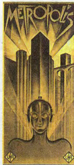
A poster from Fritz Lang's original 1927 film, Metropolis .

did for the 1995 film Waterworld – his collection continues to be attractive, especially for set decorators who visit Jadis on "scouts." After searching through Jadis' quirky assortment, decorators contact the shop on behalf of the art departments of films, television shows and commercials. Specifying their needs, decorators may choose props for the background of scenes and sometimes select what are used as visually prominent props (i.e., a large knife switch).