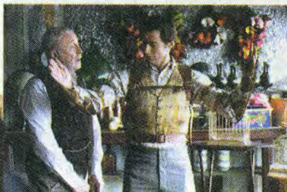
Scenes from the Universal Pictures film, The Prestige , set in Victorian era London.