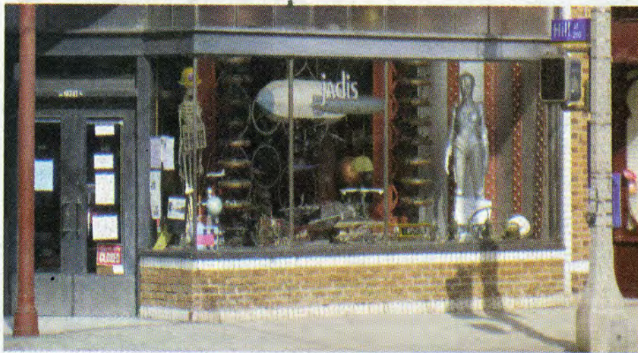
Storefront of Jadis, on Santa Monica's Main Street.